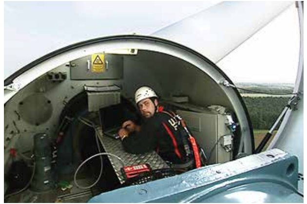
There is a 30 percent cost difference between being able to use all the available data and not having it at your disposal.

“I think Bachmann also will have a good percentage of the new turbines coming out because of that flexibility that we have across that whole automation part of wind,” he said. “Being able to provide a high-quality, long-life product is the key to this business. Some of these older turbines aren’t able to meet the changing rules of the business. But if you have an adaptable product like ours — and we don’t really know what the future will hold on some of these things — we’re confident that we can help our customers meet those unforeseen changes that are coming.”