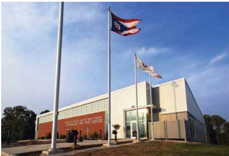
The Wind Energy Research and Development center in North Canton, Ohio.

Offshore wind energy is entering uncharted territory. And for wind-turbine designers and operators, close collaboration with a trusted bearing supplier will better enable problem solving, correct system design, and long-lasting reliability and performance. Seizing on the growing potential of wind energy depends on it. ↵