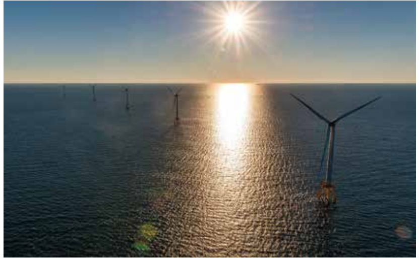
The five-turbine Block Island project was launched in December 2016 off the coast of Rhode Island.

To completely exploit the enormous range of opportunities ahead, the offshore wind industry must meet the growth parameters encompassing its evolution terrain. For instance, energy costs or LCOE for offshore wind should be regularly cut down to compete against the other forms of energy. Also, unlike every other