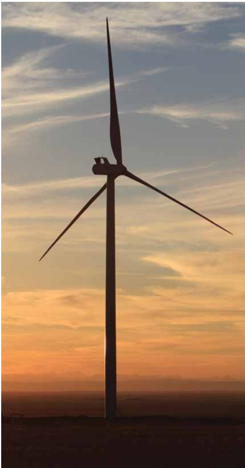
Canada now generates 83 percent of its power using non-emitting sources, and the federal government has set a target to up that contribution to 90 percent by 2030.

Despite wind energy's rapid growth, Canada has still only scratched the surface of wind energy's potential contribution to electricity production. In July 2016, the Canadian Wind Energy Association released the results of a ground-breaking study that found Canada can reliably and cost-effectively get more than a third of its electricity from wind energy. The Pan-Canadian Wind Integration Study found there are no operational barriers to reaching a 35-percent wind contribution to Canada's electricity supply. New transmission interconnections to facilitate the integration of wind energy and its movement to various markets would essentially be paid for within four years through fuel savings as more expensive coal and gas-fired generation