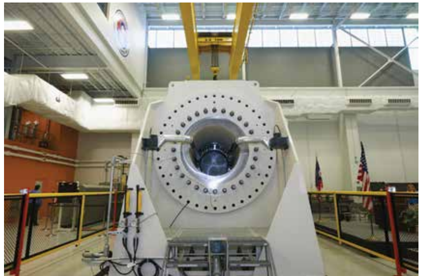
Timken and Stark State College's Wind Energy Research and Development Center tests ultra-large bearing systems up to 13 feet in outside diameter on sophisticated equipment capable of simulating wind-turbine conditions. The new test facility is expected to shorten development cycles and improve reliability and cost-effectiveness.

extreme sizes, though the investment in such larger turbines grows when accounting for ship-based transport. With the ability to construct larger turbines, the potential for greater generative capacity is increased.