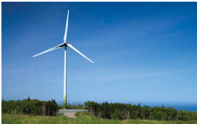
Despite wind energy's rapid growth, Canada has still only scratched the surface of wind energy's potential contribution to electricity production. (Courtesy: Glen Dhu facility, Nova Scotia)

farms, part of its commitment to produce more renewable energy than it uses by 2020.