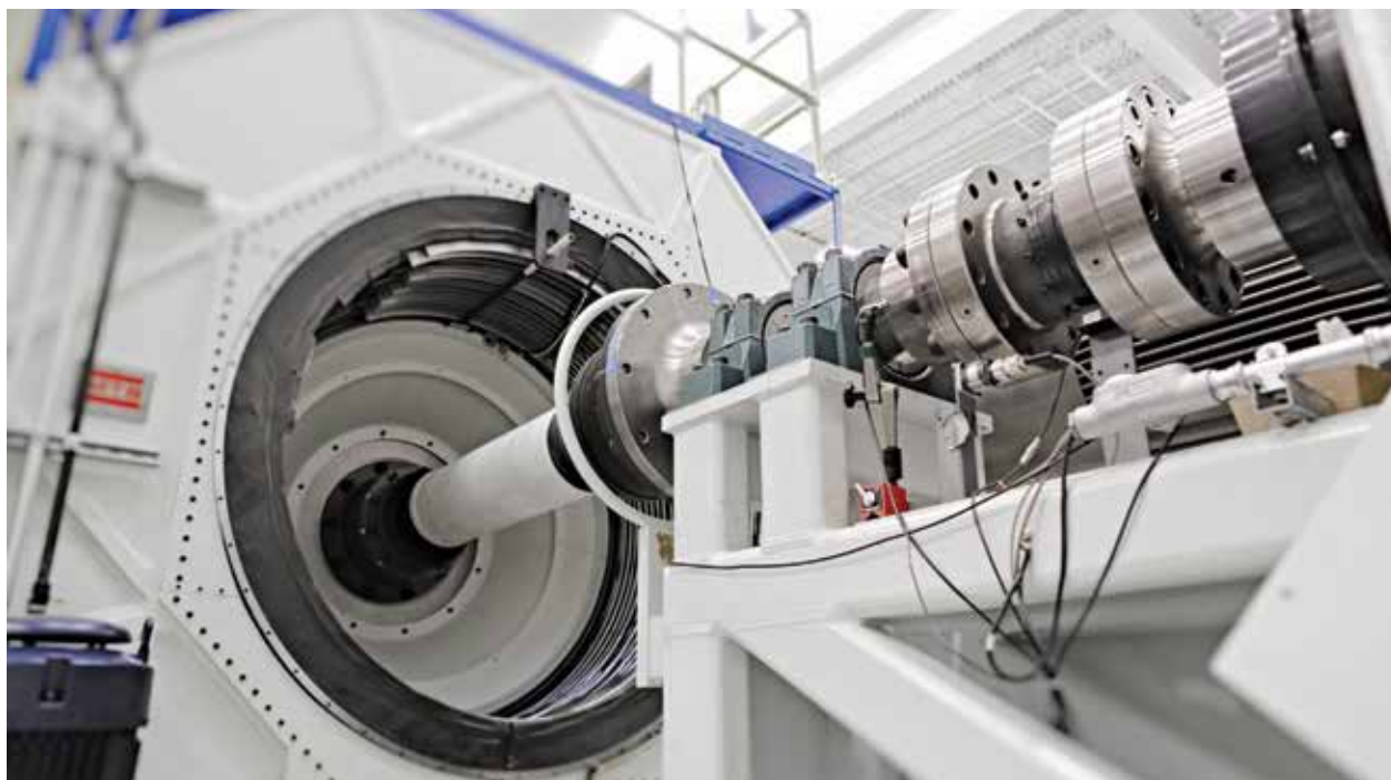
Testing capabilities within Timken's Wind Energy Research and Development Center have the flexibility to focus on wind-turbine applications.

Offshore wind has unique considerations that require technological expertise and a close, collaborative partnership.