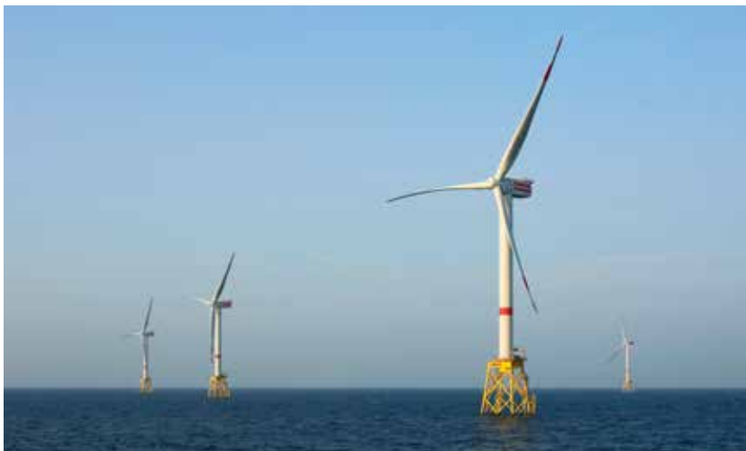
In 2016, Senvion supplied 6.2 percent of Europe’s wind turbines.

Despite having a recorded installation capacity of less than 2 GW at the end of 2015, the growth prospects for China look promising over the coming years. With a new target under the 13th Five-Year Plan to achieve an installation capacity of 10 GW by 2020, the country is poised to attain remarkable growth pertaining to offshore wind installations in the years ahead. With ongoing developments toward increasing the reliability of the offshore wind turbines, reduction in energy cost, collaboration between government entities, and favorable norms pertaining to wind-power policy systems, the Chi-