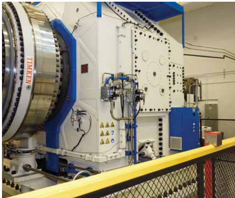
The $14 million Wind Energy Research and Development Center houses a large test rig that can handle 13-foot OD bearings. It's capable of producing load combinations experienced by utility-scale wind turbines, up to 5 MW.

and loads are far less consistent. And though the availability of land will likely lead to the continued adoption of onshore wind power in the United States, these installations will be less efficient than an offshore counterpart. Another factor to consider is inconsistent wind loads, causing the turbine to stop and start up again. This may, in fact, cause more stress on gearbox bearings and other components.