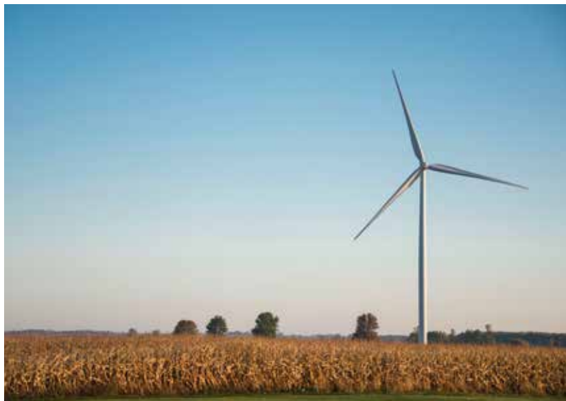
Wind power is also one of Canada's best hopes for addressing climate change.

Commercial and industrial companies such as Google are contracting for wind energy to power their operations. In the U.S., one third of all new wind-power purchase contracts are being signed by these customers. In Alberta, IKEA owns two wind