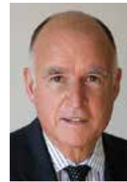
California Gov. Jerry Brown

The September bill signing is especially exciting because of its scale. Experience has shown that bold state