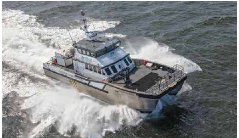
All 14 vessels in the Seacat Services fleet have been fitted with an "always-on" data connection.

"Digitalization" of operational practices, coupling remote data collection with advanced monitoring, is gaining pace as offshore wind firms throughout the supply chain aim to keep tabs on the performance of project critical infrastructure, optimize O&M and construction procedures, extend asset lifetimes, and bring down the levelized cost of energy (LCOE).