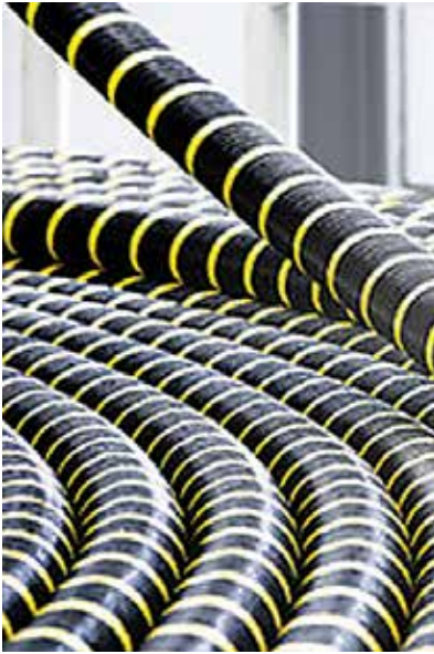
The contract scope comprises design and installation of approximately 270 kilometers of export cable that will connect the planned Arcadis Ost 1 and Baltic Eagle offshore wind farms to the onshore substation in Lubmin, Germany.