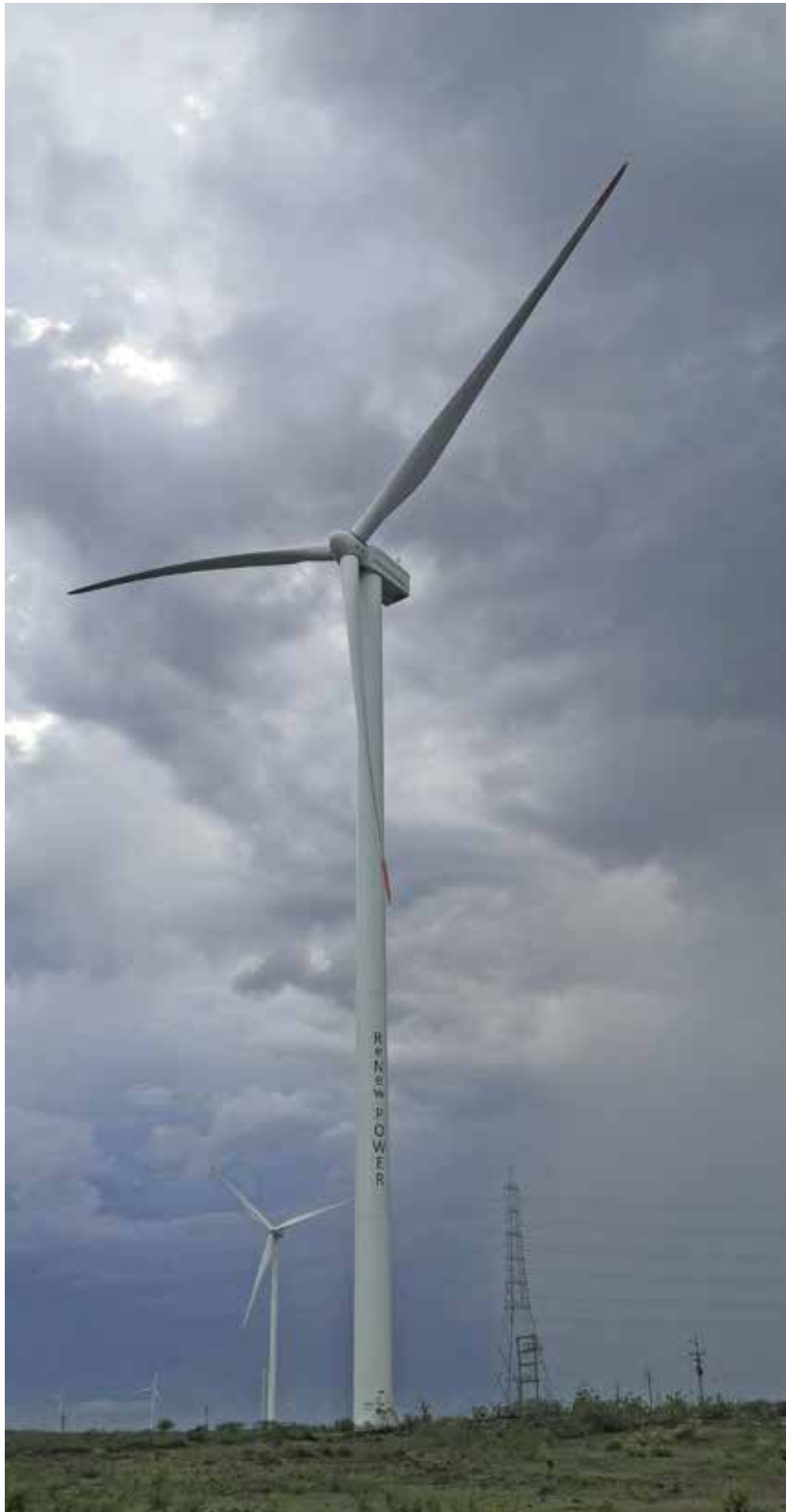
Collectively, wind farms generate about 380 billion kW/h each year in the United States.

mance of the misaligned turbine itself. Importantly, the performance of the misaligned turbine depends on the incident atmospheric wind conditions that flow into the farm. Modeling the joint effect of the angle adjustment and the incident wind conditions was critical to developing an accurate model that can predict the best possible farm orientation strategy.