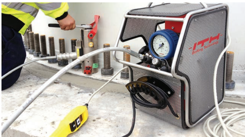
ITH performs wind-turbine bolting services on-site all over North America — also from its sub-offices in Atlanta, Georgia, and Houston, Texas. Above, wind-turbine foundation bolts are tightened precisely by an ITH bolt tensioning cylinder type MS and a compact high pressure pump unit Micro-MAX 70.

He said the ITH hardware has been used from two major wind-turbine manufacturers, and during these projects, the hardware was certified by the international accreditation body DNV-GL and German Technical Inspection Association TÜV to be maintenance-free for five years (DNV-GL), respectively for 20 years (TÜV).