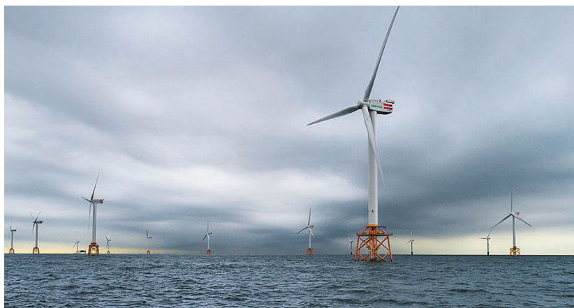
Senvion 6.2M152 turbines like these will be manufactured for the TWBII offshore wind farm.

For more information, go to www.gerenewableenergy.com