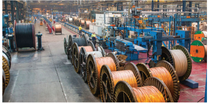
Prysmian is the largest manufacturer of cable and accessories in the U.K.