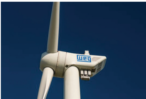
WEG India will supply the first turbines in 2018.