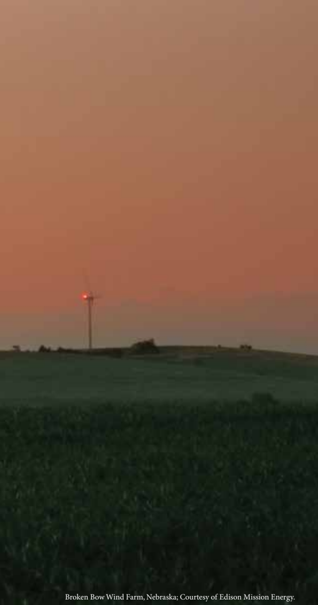
Broken Bow Wind Farm, Nebraska; Courtesy of Edison Mission Energy.

Lighting of Wind Turbine Farms. The complete Advisory Circular is available at www.faa.gov . Red flashing obstruction lights (FAA Type L-864) are the preferred lighting system for wind farms. Light fixtures should be placed as high as possible on the nacelle for increased visibility. Wind turbines around the periphery of an array of turbines should be lit. Unlighted gaps of less than one half statute mile are allowed in many instances, however, a wind turbine located apart from the grouping of turbines should be lit. The array of flashing obstruction lights should be synchronized to flash simultaneously. For daytime conspicuity turbine structures painted in a bright white or light off-white color are effective. Other colors, such as light gray or blue are less effective.