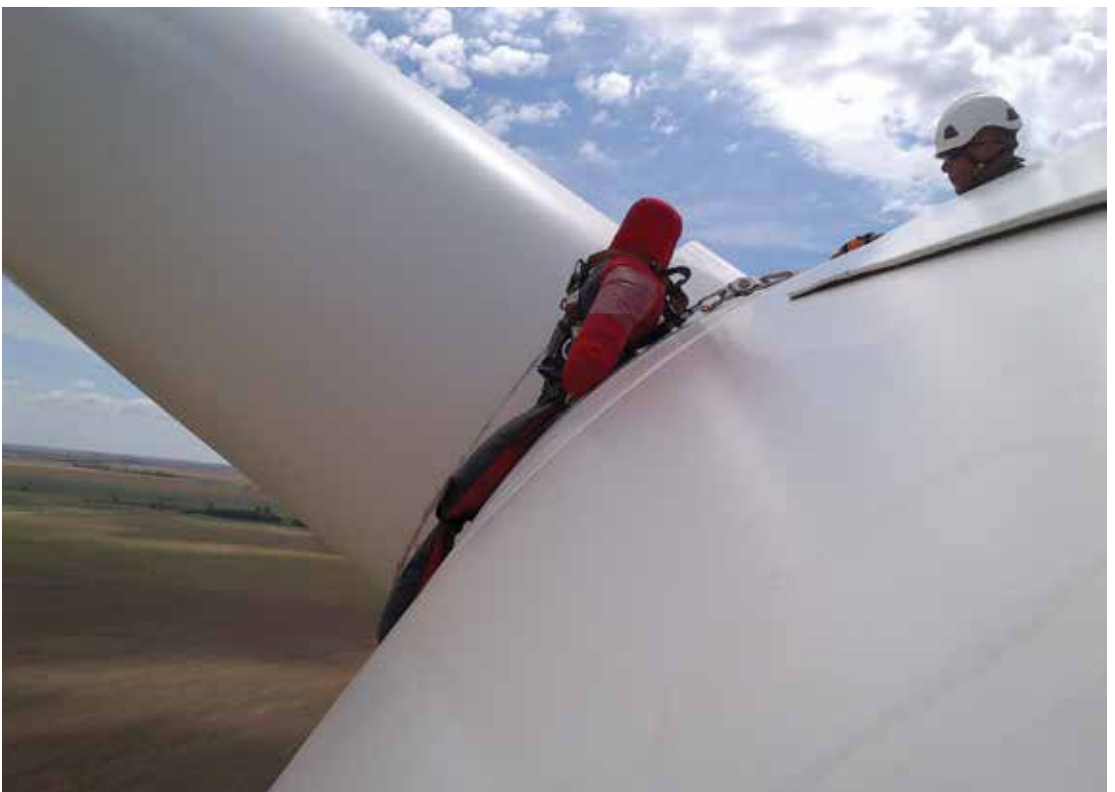
A TEAM-1 Academy crew works atop a nacelle.